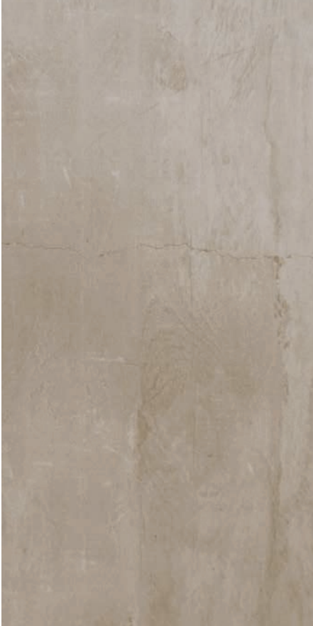
30 x 60 cm (12 x 24) UI.CC.GRG.1224

All items shown in this document are part of Olympia's stocking program. For special orders, please contact your Olympia Tile Sales Representative.