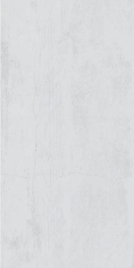
30 x 60 cm (12 x 24) UI.CC.BIA.1224